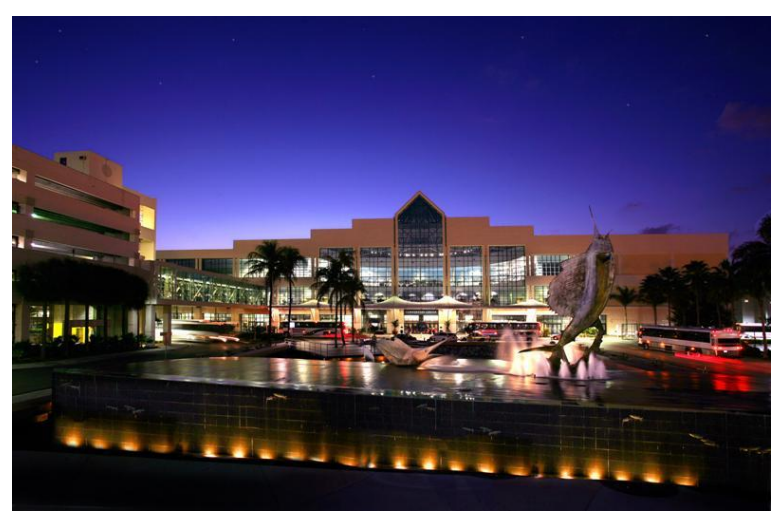
The Greater Fort Lauderdale/Broward County Convention Center is a waterfront facility that has been built along the Intracoastal Waterway.

2.1 In the years leading up to 2035, Broward County's infrastructure was maintained and enhanced to the extent that budget constraints allowed. As was the case throughout Florida, the county government relied on intermittent funding from Federal and State sources and most of the private sector offered little assistance. An exception was the hotel and insurance industries, which acknowledged the