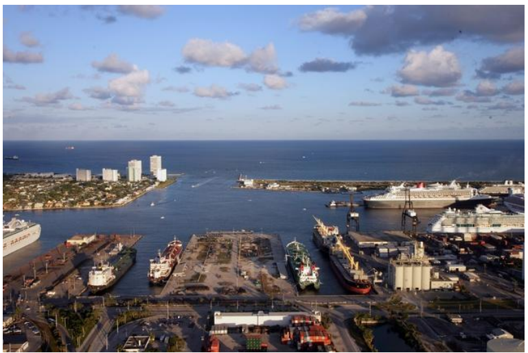
Port Everglades, Florida is one of the top three cruise ports in the world, is among the most active containerized cargo ports in the United States, and is an important seaport for petroleum products such as gasoline and jet fuel. (Credit http://www.porteverglades.net/).

2.3 Prior to 2030. waterfront and oceanfront real estate property was most valuable and was precluded from ownership by lower and middle class income households. As these low-lying vulnerable areas were more frequently flooded by storms, eventually on a daily basis by tides and gradually over time completely inundated by sea level rise, wealthy populations migrated to higher ground. Higher ground was located along the coastal ridge (an ancient sand dune running