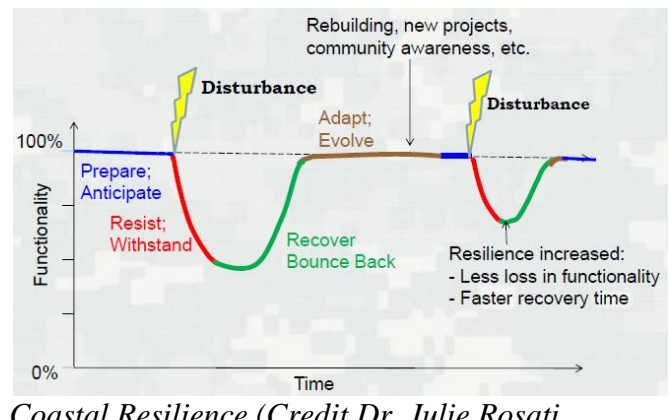
Coastal Resilience (Credit Dr. Julie Rosati, USACE, August 26, 2014).

5.1 Broward County has become more vulnerable due to usual urban issues and the additional pressure of natural hazards such as an increased occurrence of tropical cyclones. Increasing numbers of people are now living in low-lying lands that were once unoccupied because they are flood prone. Such factors stress facilities, ecosystems, and communities and weaken resilience. The response to the aftermath of Hurricane Yvonne