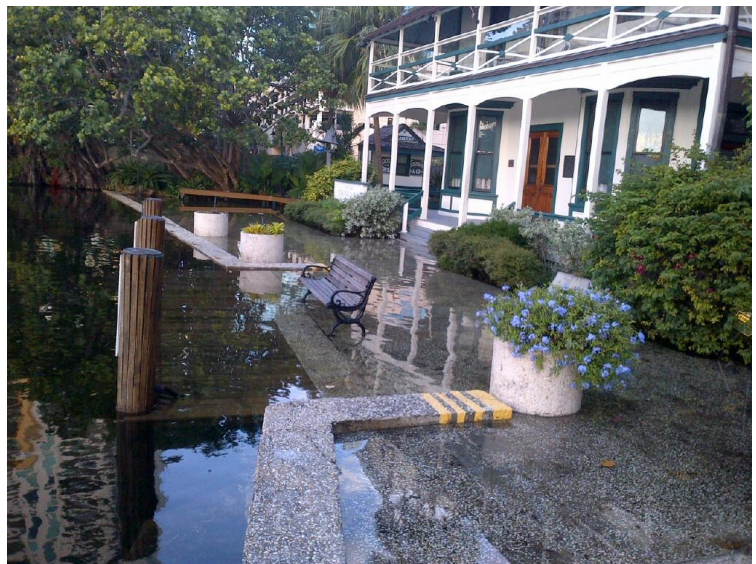
The historic Stranahan House in Fort Lauderdale is sited along the New River which originates in the Everglades and flows east.

3.2 Also, after a comparative lull of a decade, tropical storms and hurricanes resumed their assault on Southeast Florida